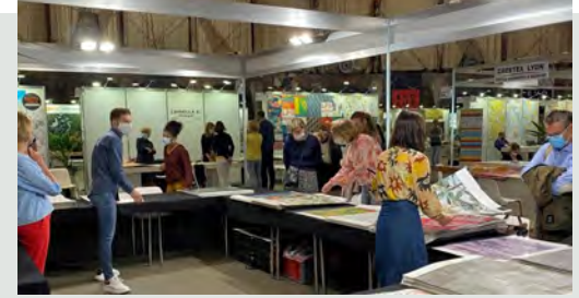
There was plenty of space at the Verbeekdesigns booth during Evolution Amsterdam.

"All felt comfortable with the COVID-19 protocols that we followed," Verbeek says. "As it was not too busy, customers had plenty of space to feel safe."