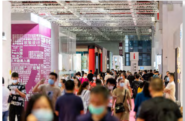
Visitors walking through Intertextile Shanghai Home Textiles in August.