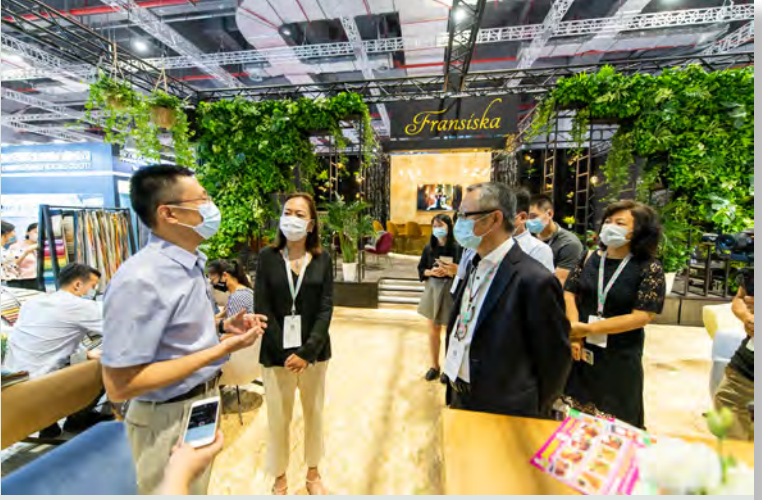
Visitors discuss business during Intertextile Shanghai Home Textiles 2020.

"However, the travel restrictions that have now been put in place and a renewed rise in the number of infections simply pose too great a hurdle for our very international event." F&FI