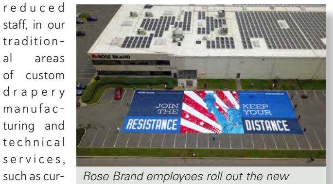
campaign in the company parking lot.

2004 - Rose Brand West moves to larger facility.