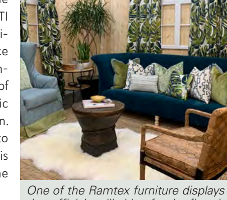
that officials will video for the first time.